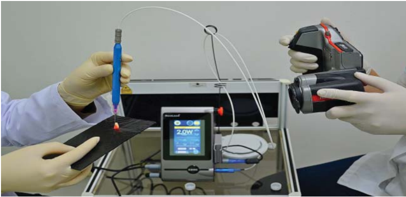
Fig. 6. Design of the investigation

The registered temperature changes in the apex and the outer root surface were within 8°C at 22 from 30 investigated teeth; at 5 teeth deviations ranged from 2°C to 4°C; in 3 cases there was a dramatic increase in temperature (Fig. 6).