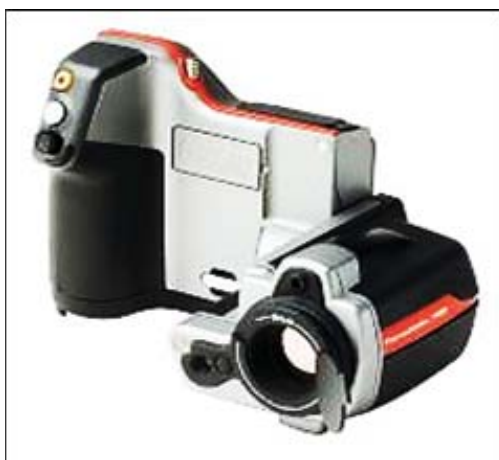
Fig. 5. Infrared camera Flir T330

The captured thermal images have been processed with software product Flir Reporter Pro 9.