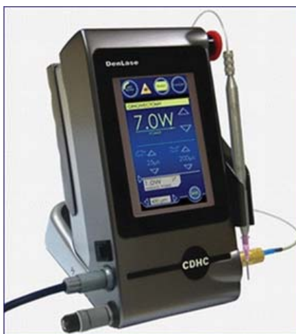
Fig. 1. Laser unit “DenLase”

A diode laser system “DenLase” with wavelength 810 nm and optic fiber with diameter 400µm has been used for the laser assisted root canal disinfection (Fig.1).