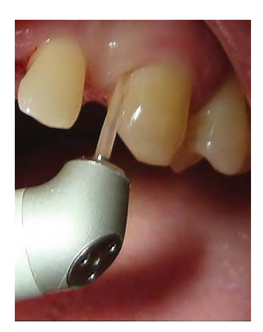
Fig. 1. Root surface debridement with Er:YAG laser

Subgingival instrumentation of root surfaces was performed with Er:YAG laser (Lite Touch, Light Instruments Ltd., Yokneam, Israel) using chisel tip with apicocoronal movements in slight angulation against the root surface (15-20°) in contact hard tissue mode. The panel settings were the following: 100 mJ, 15 Hz, 5-6 water spray level. After that periodontal pocket debridement was performed using tip 0.6 x 17 mm and energy settings: 50 mJ and 30 Hz in non contact soft tissue mode. Instrumentation ended when the operator felt smooth and clean root surface (Fig. 1).