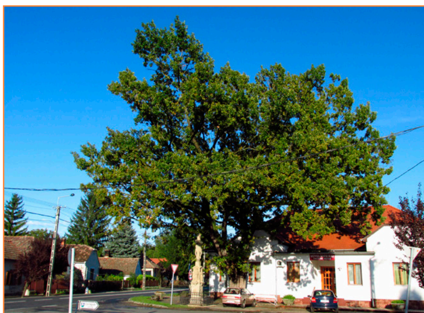
Figure 4 A neogothic roadside cross in Balatonszentgyörgy (Hungary) with a monumental common oak ( Quercus robur L.)

This thematic issue focuses on the linkage between small sacral architecture and the cultural landscape. The introductory paper discusses the origin, historical development, landscape features and heritage values of small sacral architecture in cultural landscapes with a particular focus on Europe (Tóth et al., this issue). Calaza-Martínez et al. (this issue) elaborate on sacred landscapes in Galicia (Spain), with a particular focus on small religious architecture and its symbolical character. Stara and Tsiakiris (this issue) explore the