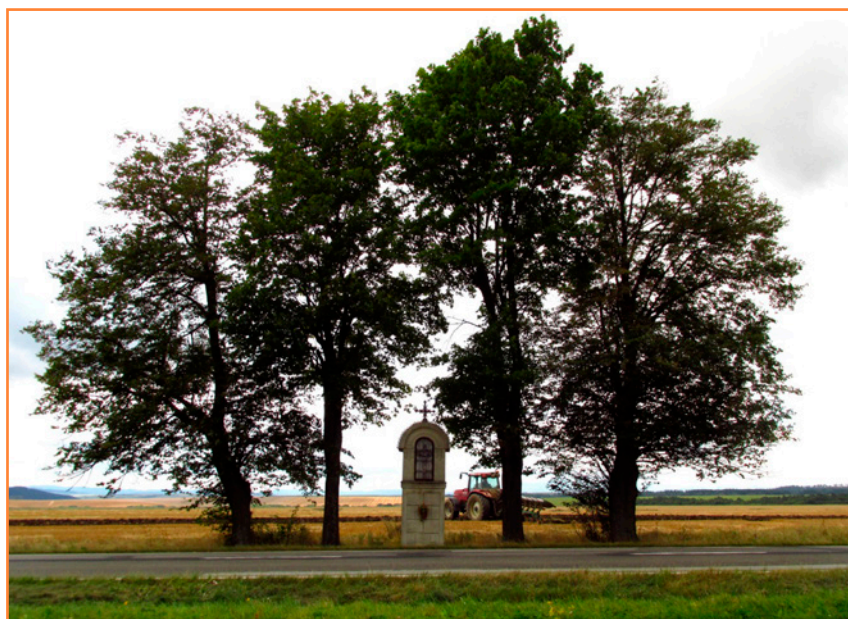
Figure 3 A roadside shrine in Spišská Belá (North-Eastern Slovakia) with 3 small-leaved limes ( Tilia cordata Mill.) and a Norway maple ( Acer platanoides L.)