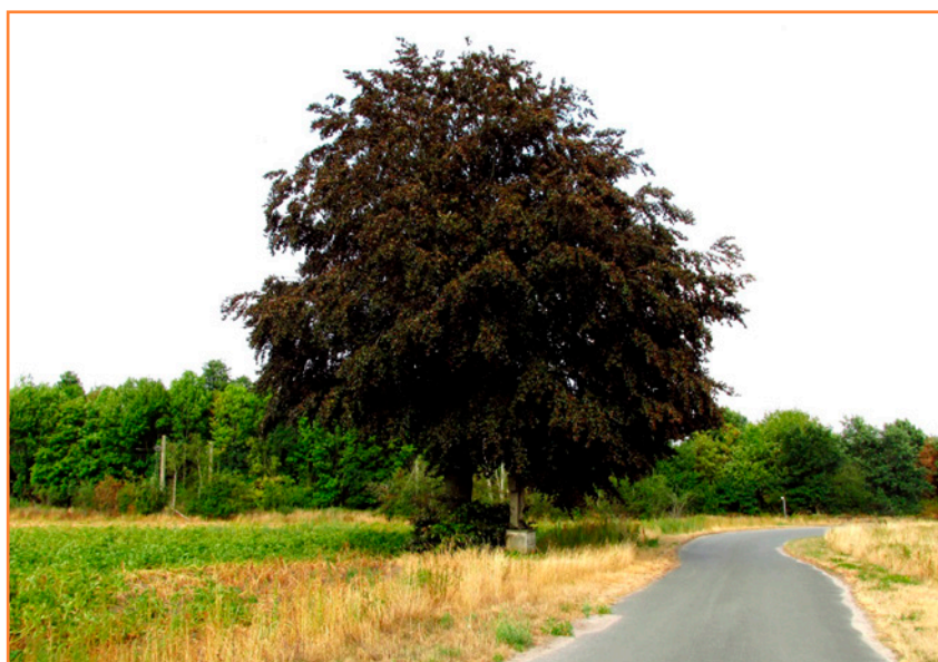
Figure 2 A commemorative wayside cross in the municipality of Emsbüren (Germany) erected after World War II for the memory of a soldier killed in action during the war. The cross is accentuated by a red-leaved common beech ( Fagus sylvatica L.). Both, the cross and the tree survived land consolidation in the 1990s

In regions with consolidated Catholic faith after the Thirty Years' War (1618–1648) the century between 1680 and 1780 is considered the peak of the creation of small sacred architecture in the landscape (Breuing, 1985). The 18 th century was characterised by the euphoria from the victory over the Turks and the Plague outbreaks. Saint John of Nepomuk, whose statues were placed mainly on riversides and bridges (Liszka, 2007) became the most common and widespread singular figural motive in Austro-Hungarian Monarchy (Katzberger, 1998). Another abundant motive was represented by plague columns crowned with statues of the Holy Trinity, which were raised on squares in village and town centres as a gratitude for the end of the plague outbreak in 1713 (Katzberger, 1998). Baroque-style crosses were created even in the first half of the 19 th century,