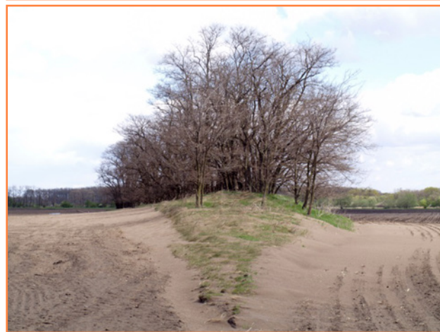
Figure 4 Height of soil accumulation in windbreak measurement