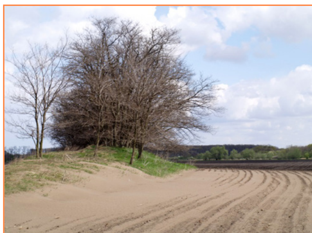
Figure 3 Volume of wind silts around windbreak