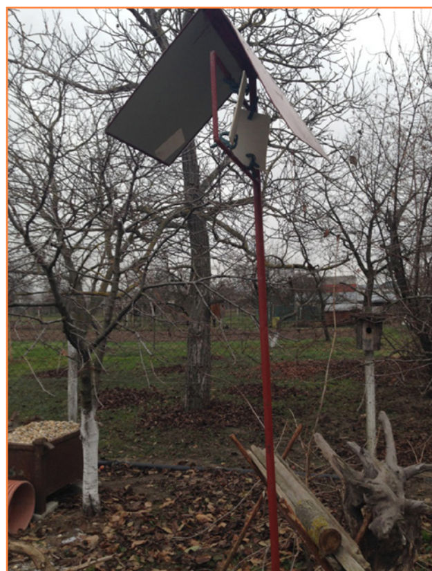
Figure 2 Weather station with the filter plate Tušice