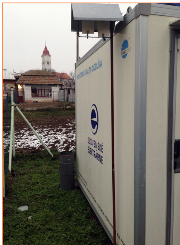
Figure 1 Weather stations with the filter plate – Leles and AMS

To determine the load by sulphur on the affected area, we chose the sorption-cumulative method which is ranked among the direct measurement methods by CSN 03 8211 (a method developed by SVÚDM – Prague Běchovice). This method is designed for long-term measurements of concentrations of SO 2 and its compounds in places where the