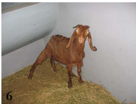
Figure 6. Goat kid with cerebellar dysfunction due to CAE.