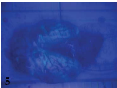
Figure 5. Brain from a sheep with polioencephalomalacia under UV light.

In goats listeriosis and polioencephalomalacia (Fig. 5) were the most frequent diagnoses (Table 2). In two farms a definite etiologic diagnosis could not be established, but histopathologic brain lesions were compatible with viral encephalomyelitis. Nevertheless, a specific viral infection could not be documented. Concurrent existence of CAE (Fig. 6) and a cerebral abscess was recorded in one case.