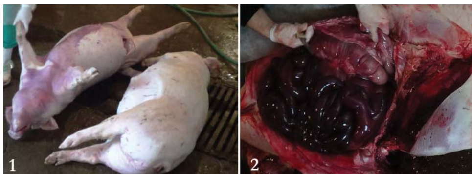
Figure 1. Pronounced distension of the abdomen of fresh carcasses – necropsy