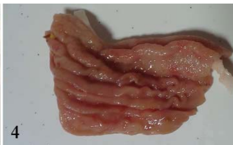
Figure 4. Corrugated appearance of the ileum – slaughterhouse examination