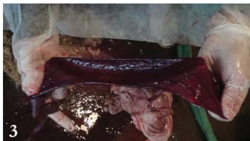
Figure 3. Hemorrhagic enteritis of small intestine – necropsy

portions of the intestinal crypts had a relatively characteristic structure. Connective tissue of the lamina propria was infiltrated by inflammatory cells (Figure 8).