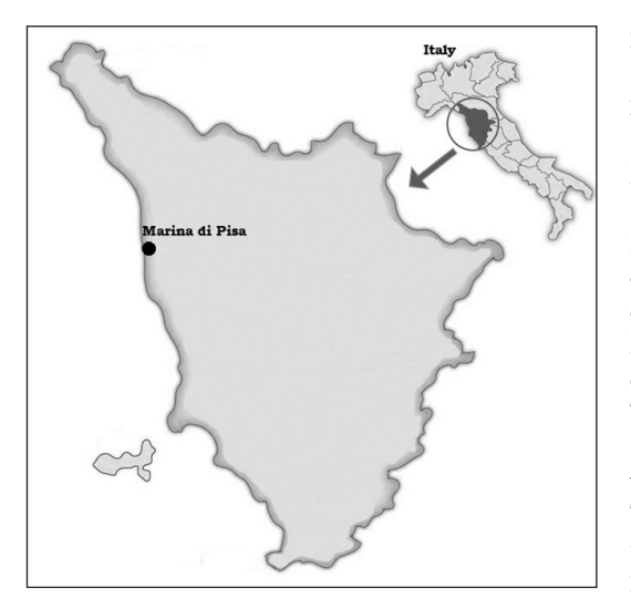
Figure 1: Study area near Marina di Pisa in Italy where the Barn Owl pellets were collected

Slika 1: Obravnavano območje blizu kraja Marina di Pisa (Italija), kjer so bili nabrani izbljuvki pegaste sove