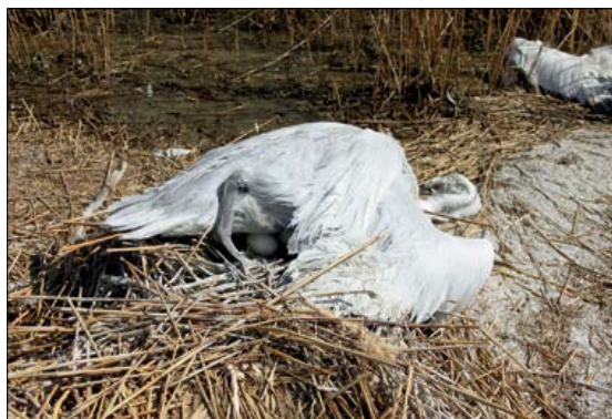
Figure 3: Dalmatian Pelican Pelecanus crispus dead on the nest

Danube and a few small inland lakes; nesting sites were also recognized along the continental coastline of the Razim-Sinoie lagoon system (VASILIU & ŠOVA 1968, TĂLPEANU 1970, PAPADOPOL 1976, WEBER et al. 1994, MUNTEANU 1998, CIOCHIA 2001). Occasional breeding has also occurred elsewhere (CUZIC 2004, BOTNARIUC & TATOLE 2005). The presence of the species in the Danube Delta usually rests on sparse observations of solitary individuals or small groups, with no evidence of nesting. Ruddy Shelduck nesting in the actual Danube Delta was first confirmed in the summer of 2015 on the salt lake situated between the villages Letea and C. A. Rosetti, on Letea Dune. In early June, conservation ranger Lupu Costel reported a family of Ruddy Shelduck with 12 ducklings, which he had repeatedly observed. The area further held three Shelduck Tadorna tadorna families, with 3, 4 and 7 ducklings respectively. On 25 Jun we secured a series of confirmatory photographs with the female and ducklings.