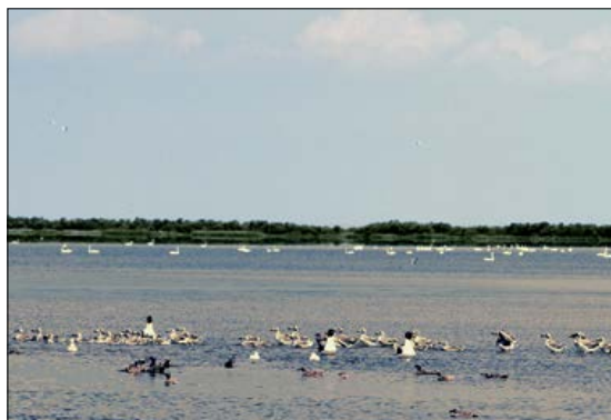
Figure 7: Pallas's Gull Larus ichthyaetus nursery in the water

Slika 6: Odrasli ribji galebi Larus ichthyaetus varujejo "vrtec" mladičev na obali.