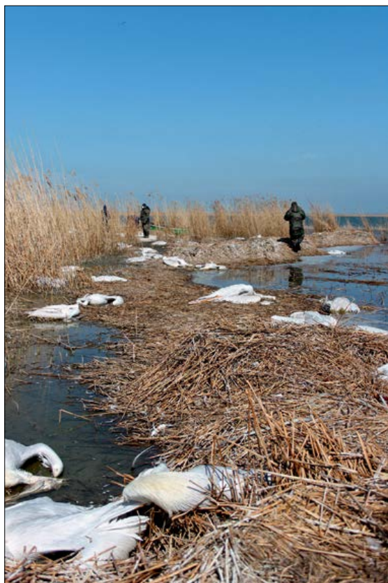
Figure 2: Dead Dalmatian Pelicans Pelecanus crispus in the colony

Slika 2: Poginuli kodrastí pelikani Pelecanus crispus v koloniji