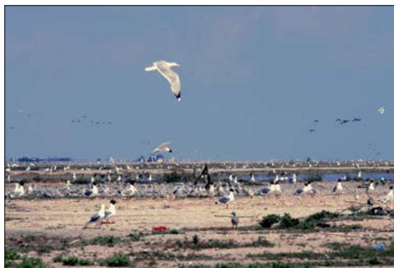
Figure 6: The parent birds form a perimeter around a Pallas's Gull Larus ichthyaetus nursery on the shore (photo: B. J. Kiss)

Slika 6: Odrasli ribji galebi Larus ichthyaetus varujejo "vrtec" mladičev na obali (foto: B. J. Kiss).