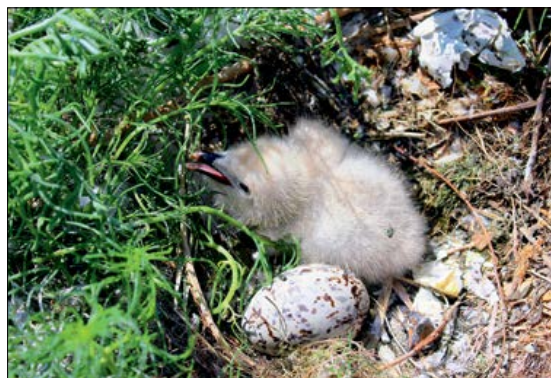
Figure 5: Pallas's Gull Larus ichthyaetus nest with egg and a two-day young

On 29 May 2014, in the eastern part of the Danube Delta close to the village of Sf. Gheorghe, we observed a male sitting on a prominent plant stem, repeatedly flying off to catch insects, but always returning to its prominent position. Other Citrine Wagtails were not observed in its vicinity, but its vigilant attitude suggested a nest nearby.