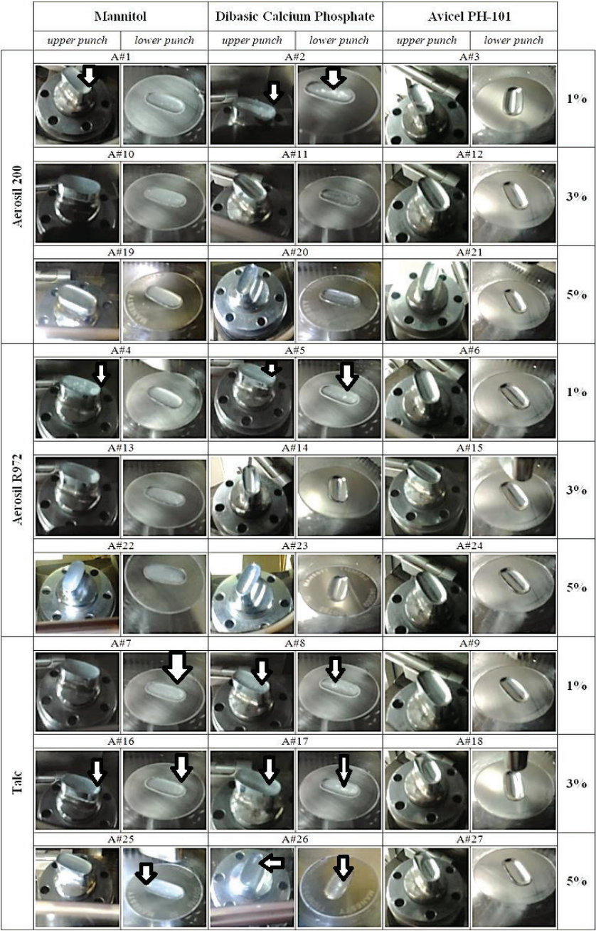
Fig. 2. Photograph of upper and lower punches after compression of L-carnitine-L-tartrate tablet formulations with formulations that showed sticking.