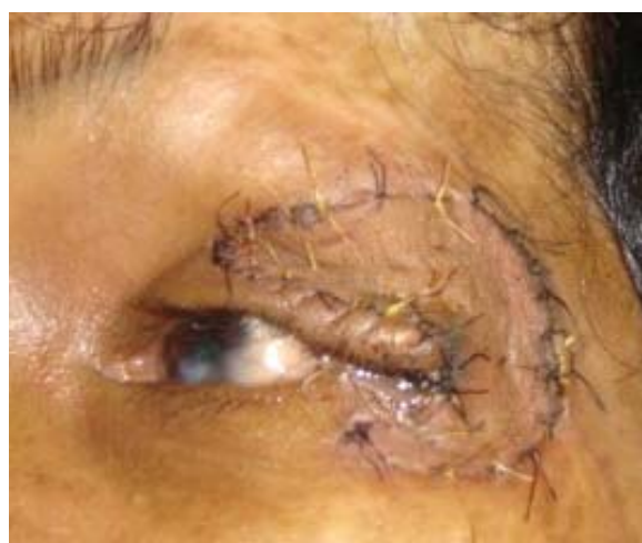
Fig. 8 Left eye ectropion repair with full-thickness skin graft.