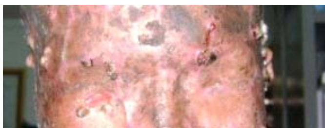
Fig. 1 Direct insult of acid to the ocular region.

thus promoting epithelialisation. In total LSCD, where the entire circumference of the cornea is damaged, transplantation of LSC grafts can be performed with autologous cells from an uninjured eye, or allograft transplantation can be carried out. Autologous transplantations, first introduced by Kenyon and Tseng [13], involve transfer of LSC grafts from the healthy contralateral eye to the injured eye. Conventionally, two large free grafts of 5-7 mm limbal length are taken, although the exact optimal size is not known. Although occurring rarely, there is a risk in the donor eye of corneal keratitis and infection, and even perforation due to the development of LSCD [11]. When both eyes are involved, allograft transplantation (LSC from living donor or cadaveric eyes) may be considered. However, this adds the risk of graft rejection and systemic immune-suppression would be required. Amniotic membrane, an immunologically inert tissue, promotes epithelialisation and suppresses inflammation, and may be useful in the surgical treatment of eye burn injury. It can serve as a patch or graft in partial LSCD (following primary insult or as a result of graft harvest) [11], and provides an inflammation-free environment in which epithelial cells can proliferate in LSC grafting [9]. Some features of LSCD are shown in Fig. 3-6 .