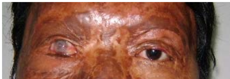
Fig. 6 Conjunctivalisation and corneal vascularisation from limbal stem cell deficiency following ischaemia.

Eyelids serve to protect the anterior surface of the globe and distribute the tear film [3], but these functions are lost with scarring and/or contracture of the eyelids, increasing the risk of corneal abrasion with subsequent opacification and thus visual impairment [14]. Blindness can thus result as a secondary phenomenon, due to impaired function of the eyelids. It was relatively easy to surgically prevent this cause of blindness, as long as the patient presented in a timely