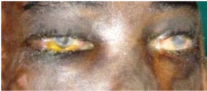
Fig. 5 Corneal haziness from limbal cell ischaemia and total ischaemia both eyes.