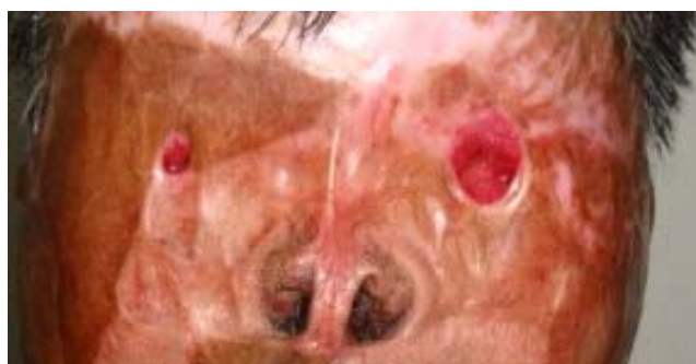
Fig. 2 Direct insult of acid to the ocular region.