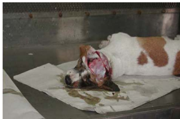
Fig. 2 Removal of brain for FAT.