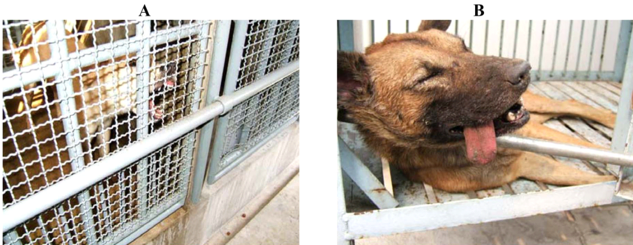
Fig. 1 A: Furious rabies. Biting cage. B: Dumb rabies. Drooping jaw.

owned or stray, may have bitten a human or an animal during the past 10 days, and may have been standing or lying down on admission. However, they were all older than one or more month old, did not show the “Circling” sign within one week prior to admission, were never immunized with rabies vaccine, caused unprovoked bites, and were bitten by stray dogs during the past two months. Furthermore, all of the dogs were sick or showing abnormal behavior on the day of submission, have been sick for less than 10 days, and have had a gradual onset. A high percentage of rabies was found in dogs with progressive sickness with rapidly downward course and dogs in an area where a rabid dog was found during the past two months (69% and 80%).