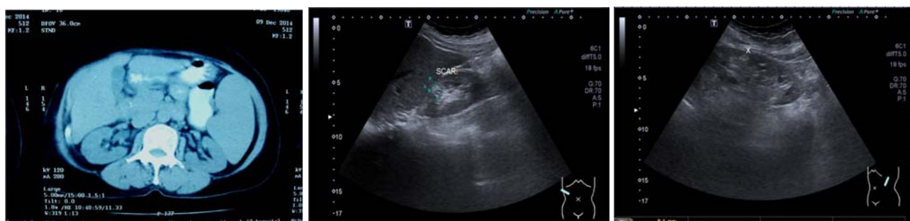
Figure 1. (left) CT of the abdomen of a 59-year-old Thai woman showing a huge mass anterior to her right kidney. Lymphadenopathy was not seen. The rest of the image appeared normal. (middle and right) Ultrasonography of the kidney after partial nephrectomy showed ureter and bladder, normal size kidneys, and normal cortical thickness. The size of the right kidney was 9.7 cm long with a 9 mm cortical thickness, and the left kidney was 10.1 cm long with a 10 mm cortical thickness. An echoic area suggestive of a surgical scar is noted in the right renal upper pole. The rest of the image is unremarkable with a clearly defined corticomedullary junction and smooth renal contour. There was neither definite renal stone nor hydronephrosis.

This study was approved by the Ethics Committee of Rajavithi Hospital (approval No. 103/2559). Written informed consent was obtained from the patient to publish this case report.