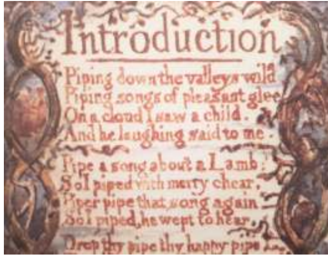
Figure 2. Close-up of William Blake's poem "Introduction"

as a mission to make people realize that the truth is beyond what is considered physically perceivable and to help free their power of imagination by cleansing their apprehension of the world. The melting together of image and text makes the illuminations an integral part of the work that allows the reader to acquire an understanding and construct an interpretation of the text by means of his or her own associations. The intricate designs and adorning of the poem "Introduction" [Figure 2] from the volume Songs of Innocence and of Experience are made up of intertwined, vine-like plants with miniature scenes in every loop, that create a frame for the poem. Next to a river, climbing up the vertical plant, one can observe the figure of men and women, young and old and perhaps most remarkably a man whose posture resembles that of Da Vinci's Vitruvian Man or Blake's Glad Day , signifying freedom and bliss, love, affection and joyfulness for getting across the message of God (the Lamb). The poem "The Lamb" depicts a similar scenery of the river and the circular vegetative outline that do not interfere with the letters, but seem to offer a protective space for the naked young child who stands amongst the lambs (zoomorphic doubles of God). If in the Chi-Rho page of the Book of Kells there was an example of the cat and mice living