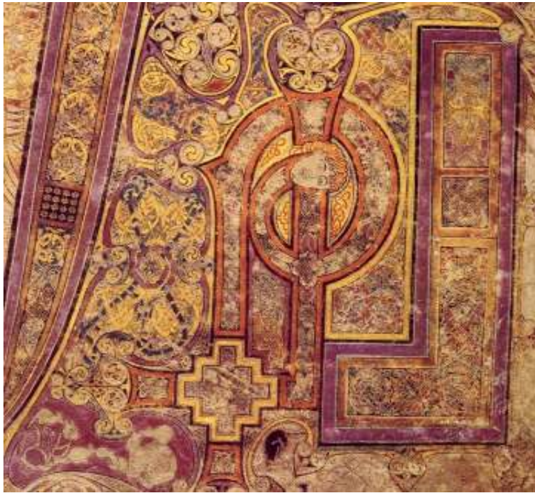
Figure 1. Close-up of the Chi-Rho page from the Book of Kells

It was little wonder that this illuminating altar book was considered to be a supernatural creation, as most such manuscripts were thought to be written with the help of angels and visions of saints; this made them holy, blessed objects that were not only held in great reverence, but were also thought to have healing powers (Jones). While there are many errors in the text based on the Vulgate, the Latin Bible translated by St. Jerome in the fourth century, its embellishment with intertwining images of animals, humans, angels, zoomorphic creatures, vines, spirals and knots is irreproachable. Illustrations of geometric, abstract or representational figures are found at the end of all lines, on the marginalia and between certain words to mark the beginning of important passages, but perhaps