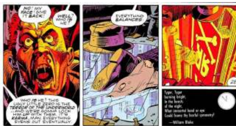
Figure 5. From Allan Moore's The Watchmen

As most western graphic novels nowadays, Moore's panels are created to be read from left to right, without offering the reader the freedom to choose which image relates to what piece of writing and in what way. Furthermore, while both medieval Christian scribes and Blake succeeded in "keeping word and image integrated" (Viscomi), graphic novels clearly delineate the border between the two, always separating them by means of narrative boxes or bubbles, "facilitate[ing] a binary relationship between the text and the image, where one aspect is always privileged at the expense of the other" (Ditto). It is true that the interaction of the two media is fundamental for the experience of graphic novels, and there is no official separation of them as different disciplines, yet on the page, images and words are no longer truly blended but seem to be always neatly arranged in separate boxes. Also, some critics have accused the graphic novel of limiting instead of expanding the reader's power of imagination, because they offer ready-made, mimetic images that have a clear, direct correspondence to the text. At the same time, the defenders of this genre assert that while "each comic panel is a moment frozen in time, your mind connects the dots" (Campbell 21), so the reader is the one who ultimately enriches the story with his or her own active creative input.